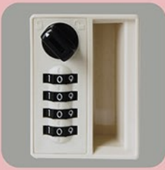
3S Keyless Lock