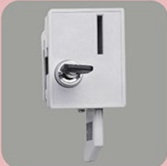
Coin Return Lock