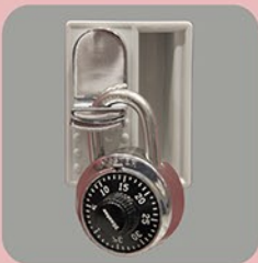
Hasp & Master Combination Padlock