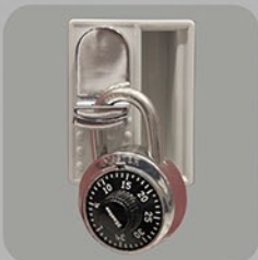
Hasp & Master Combination Padlock