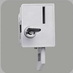
Coin Return Lock