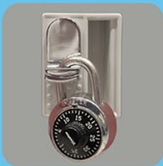
Hasp & Master Combination Padlock