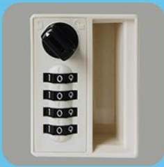
3S Keyless Lock