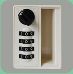
3S Keyless Lock