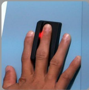
Finger Vein Pattern