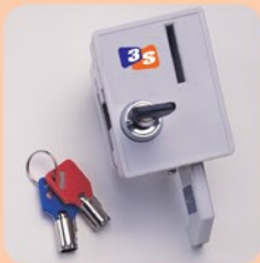
3S Coin Return Lock