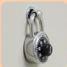
Pinpost & Master Combination Padlock