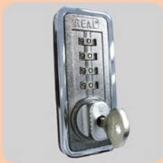
Real Keyless Lock