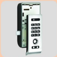
RFID (Digital) Lock