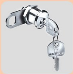
Cylinder Cam Lock