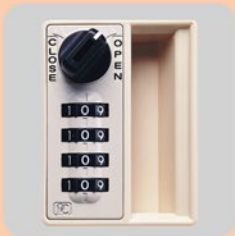
Clover Keyless Lock